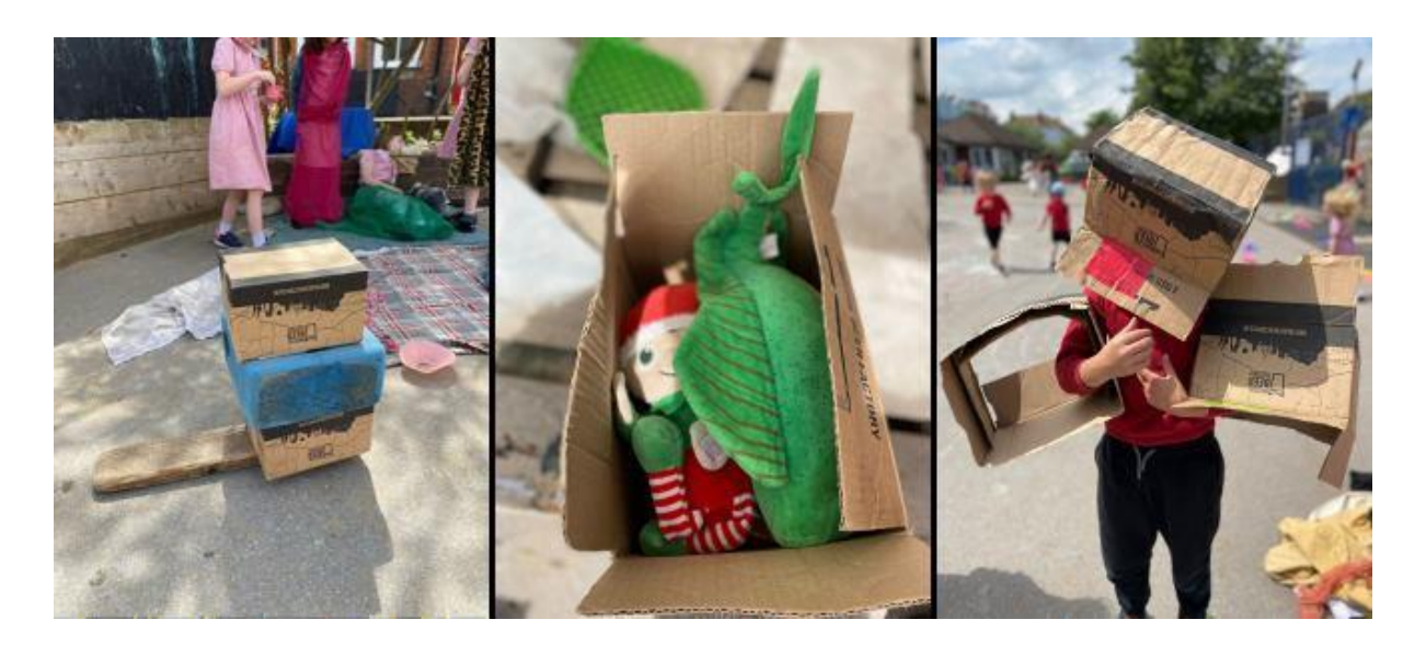
Alongside the boxes, we have seen the children particularly enjoying the making table and there has also been lots of den building this week...